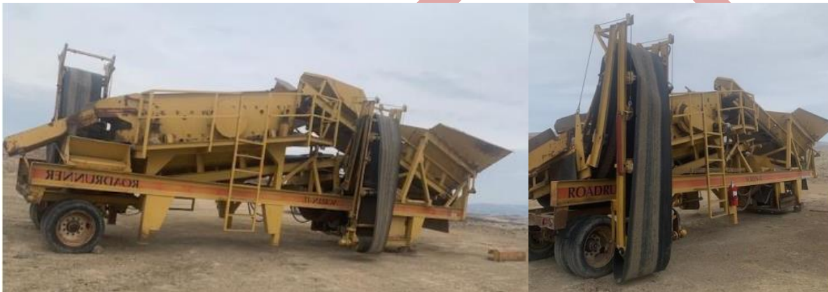
Figure 3: DTG's CEC 5x12 screen equipment.