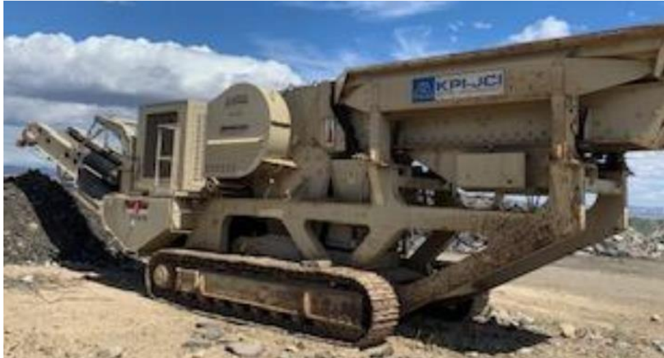
Figure 2: The Astec 2640 Jaw Crusher.